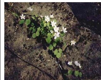
Flowers on rocks at Penny's Bend....

So...put on your walking shoes and bring your children, grandchildren, and leashed dogs. Aim your cameras at unusual sights close to Treyburn. And... hike the Bend Trails for an hour or two with Penny's ever-present ghost.