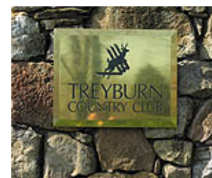
Winner of the Contest will receive dinner for 4 at Treyburn Country Club.

The winning name will be selected by the Communications Committee and the Board...and the winner will receive dinner for four at Treyburn Country Club . Deadline for entries has been extended until February 6 th . (There is no limit to the number of entries you can submit).